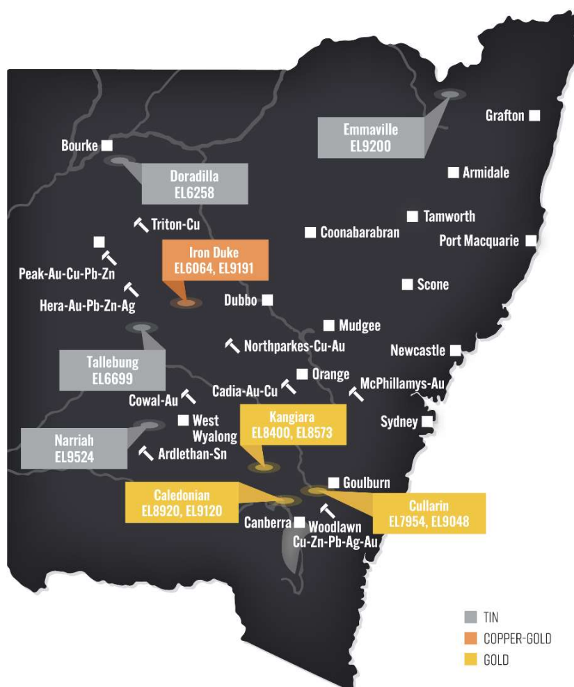
Figure 2: SKY Tenement Location Map

Highlight, 'McPhillamys-style' gold results from previous exploration include 36m @ 1.2 g/t Au from 0m to EOH in drillhole LM2 and 81m @ 0.87g/t Au in a costean on EL8920 at the Caledonian Project.