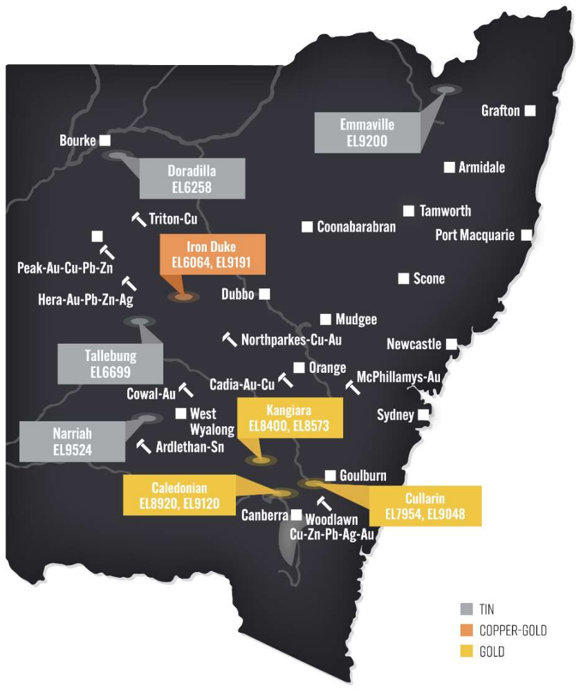
Figure 2: SKY Tenement Location Map

Highlight, 'McPhillamys-style' gold results from previous exploration include 36m @ 1.2 g/t Au from 0m to EOH in drillhole LM2 and 81m @ 0.87g/t Au in a costean on EL8920 at the Caledonian Project.